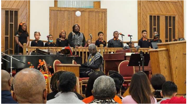
Our Spring Garden Academy Youth Choir performing at a multi-church benefit concert