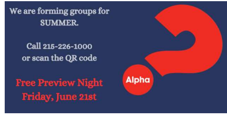
Pray with us for this latest round of Alpha classes.