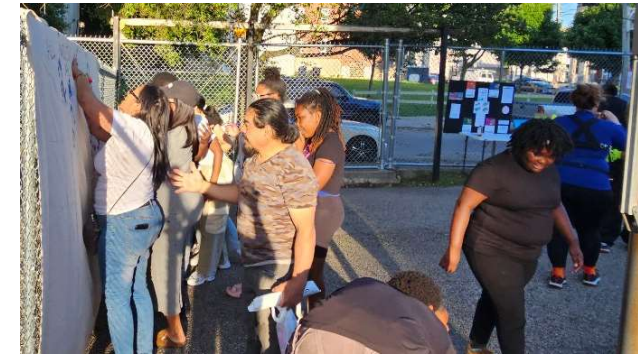
Good weather = a great opportunity to meet our neighbors!