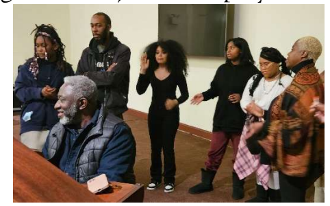
Closing out Week of Prayer with praise!